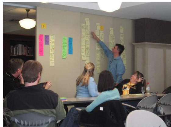
Parish Core Values need to be shared. Determining if values are shared broadly, requires conversations, often structured, in small groups.