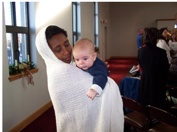
Sometimes just the right photo can help participants envision a brighter, warmer parish future

Generating new images of "possibilities" for a parish is not easy for most. It's well nigh impossible for others. One difficulty is that words -- spoken, and particularly written -- are difficult for some. Images or photos can help. To seed the conversation about what our vision could be , use a collage of photos of parish life, behaviors and ministries. These can be from your parish or others. From the collage of 15- 30 photos of parish life ask small groups to discuss what is most important to their version of a future parish. Settle on four to six that best represent that vision. We've collected a good set of photos and can easily share them if you ask .